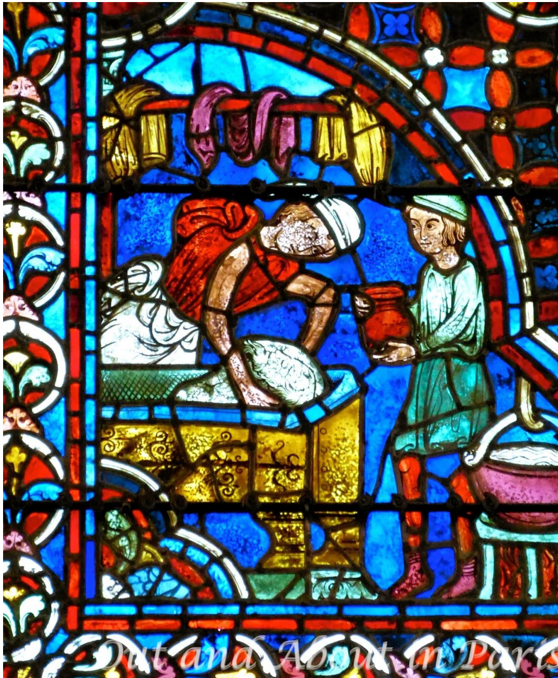
Bakers' Window Chartres Cathedral